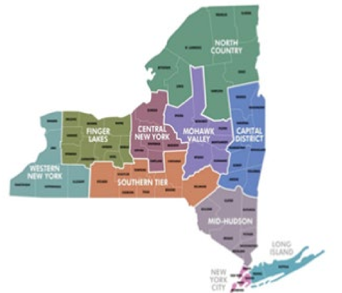
NEW YORK STATE REGIONAL MAP